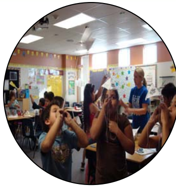
Third graders saw the effects of gravity by creating a parachute with a launch.