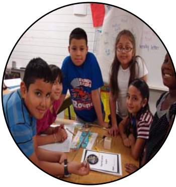
The fourth graders were all smiles while designing their own inventions .