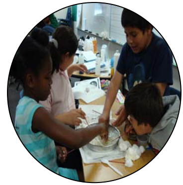
Fifth graders were making waves, while learning about density.